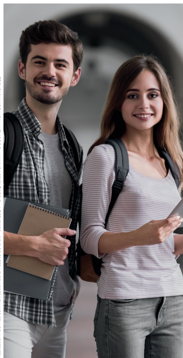
Réalisation : Service communication de la Faculté de droit - Juillet 2024 - DOCUMENT NON CONTRACTUEL